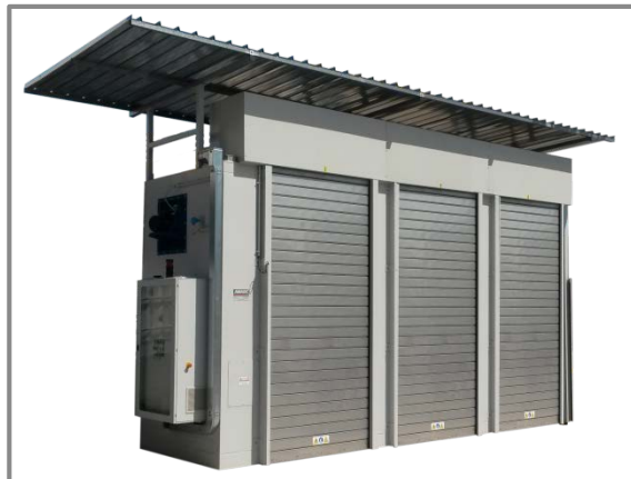
» Drum Heating Cabinet with Outdoor installation and roller - shutter doors