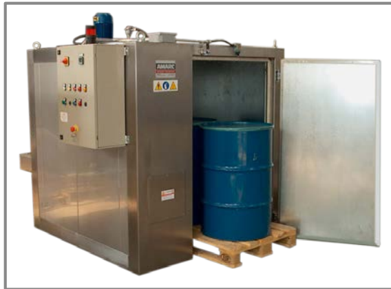
» Stainless Steel Drum Heating Cabinet