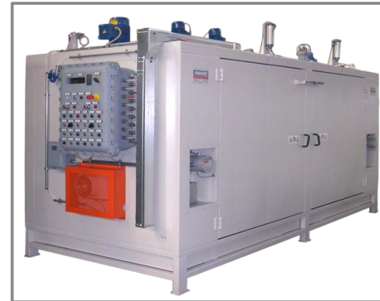
» Drum Heating Cabinet for Hazardous Area Installation